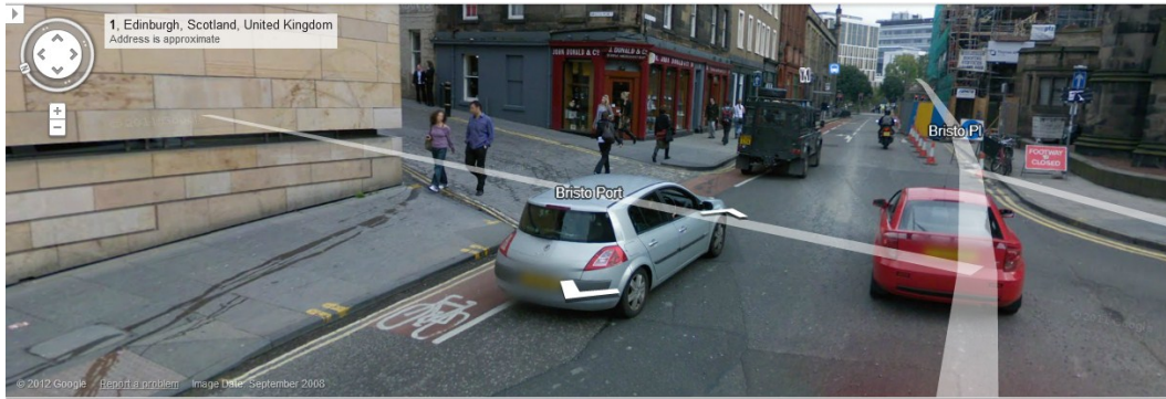
(Above) When you reach the Bedlam Theatre at the end of George IV Bridge, take the left fork - you can now see Appleton Tower pictured in the far distance.