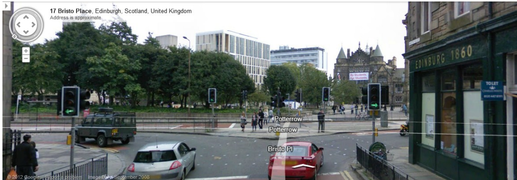
(Above) The University campus is now really close. Cross the at the lights into Bristo Square and keep heading in the direction of the modern tower buildings in the distance.