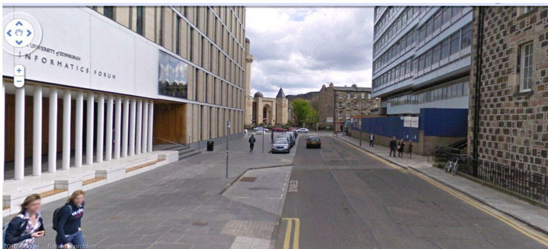
(Above) And here we are! Appleton Tower is the 1960's tower building on the right of the picture - you can see some people in the image about to enter Appleton Tower.